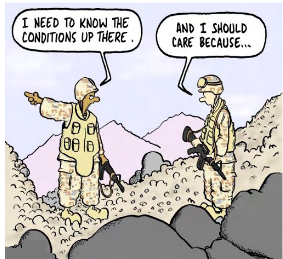
Sometimes it's easy to find an ARMY Volunteer!