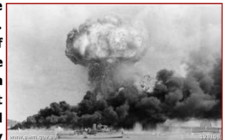
Bombing of Darwin - 1942

The Japanese air raids on Darwin on 19 February 1942 were the largest attacks ever mounted by a foreign power against Australia. They were also a significant action in the Pacific campaign of World War II and represented a psychological blow to the Australian population, several weeks after hostilities with Japan had begun. The raids were the first of almost 100 air raids against Australia during 1942-43. This event is often called "the Pearl Harbor of Australia". Although it was a less significant military target, a greater number of bombs were dropped on Darwin than were used in the attack on Pearl Harbor, Hawaii.